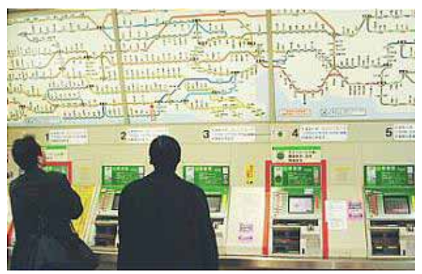
Ticket vending machines with map of lines and stations

Sometimes, the station names on the maps are written only in Japanese. If you are unable to find your destination and the corresponding fare, just purchase the lowest price ticket (for a particular line) and pay the difference at the destination station.