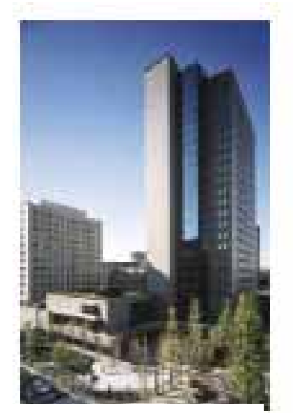
NII (National Institute of Informatics)