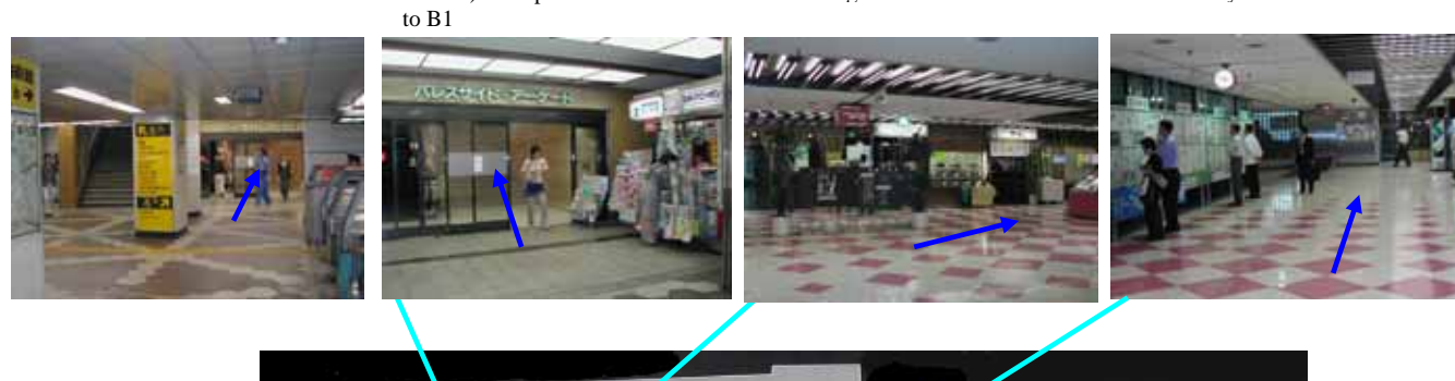
B1 Floor map of Palaceside building

4. 2. You will pass newspaper panels at the end of the wide arcade on your left