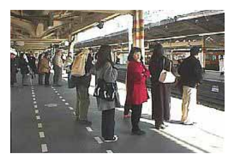
Passengers waiting in lines on the platform

Find your platform by looking for your train line and direction. Most important signs are written in Japanese, English (i.e., Roman alphabet), and, increasingly, in Chinese and Korean. On many platforms, marks on the floor indicate where the doors of the arriving train will be located. Waiting passengers should line up behind those marks (since train drivers are trained to stop within centimeters).